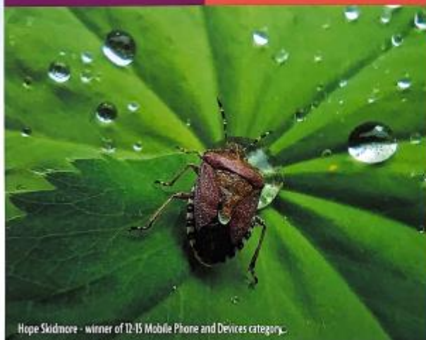
Hope Skidmore - winner of 12-15 Mobile Phone and Devices category.